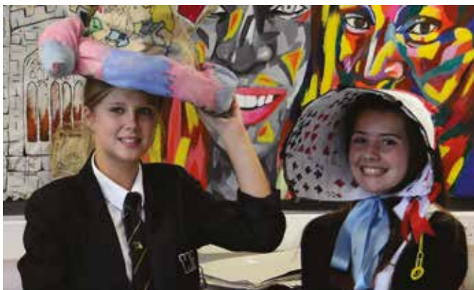
Students from Whitley Academy wearing hats they designed

We encourage teachers and learners to investigate ways to improve practice and school life, to work with colleagues across the RSA Family and participate in the wider work of the RSA to develop new ideas and share best practice.